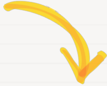
Table of Contents!